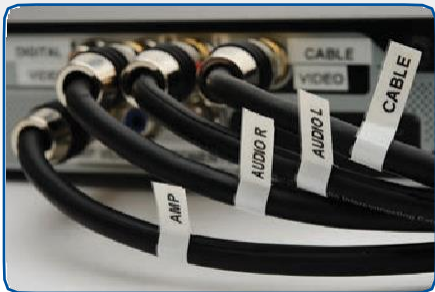
Use in the Media Room...