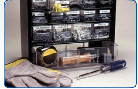
Even in the Garage!

Create custom labels with a variety of frames and symbols